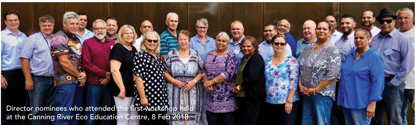
Director nominees who attended the first workshop held at the Canning River Eco Education Centre, 8 Feb 2018.

SWALSC has now re-opened nominations to any other eligible member who is interested in putting their name forward to be considered by the pre-incorporation meetings (see above).