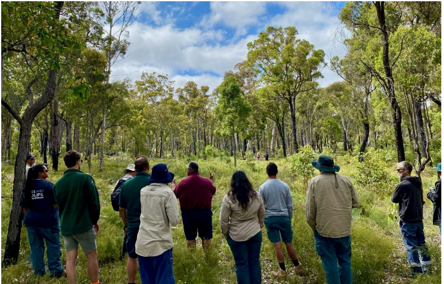
Picture above: SWALSC Noongar Ranger Trainees on Boodja in Collie with Noongar Elders and professionals learning about cultural heritage site management.