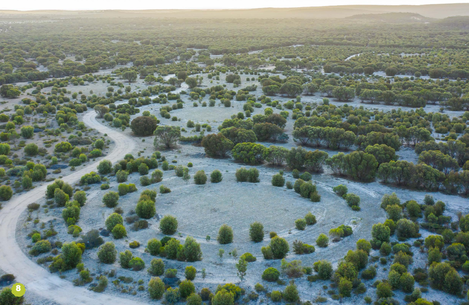
Opposite: Karda cultural planting at Yarrabee, 2017.