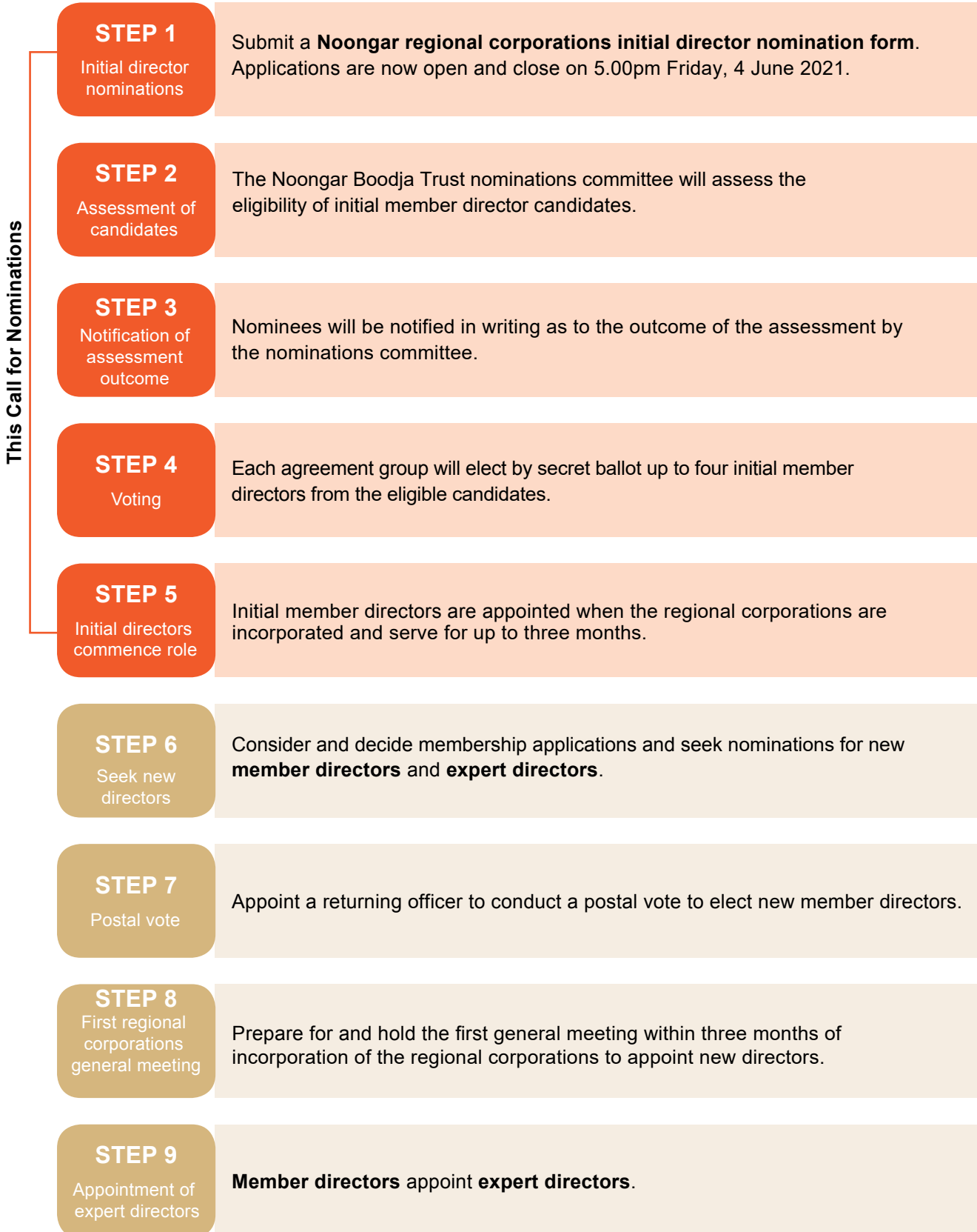
Diagram 1: The process of election for a Noongar regional corporation director