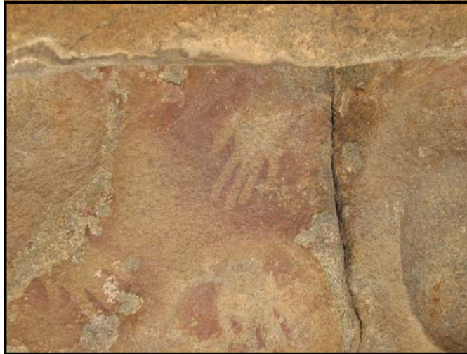
Above, hand stencils at Shark's Mouth, Kellerberin.