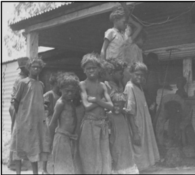
Children at the Moore River Settlement

Kaartdijin Noongar or Noongar Knowledge is a collection of information stored on a computer for the Noongar community to conserve, share, express and sustain various aspects of Noongar culture.