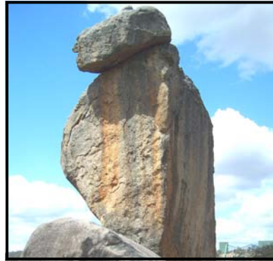
Owl Rock in the Darling Range

Yes, you must have a valid login password to access the site; no password no access. New users may register before they will be granted permission to access the information. In addition to this login, activity is constantly and closely monitored by four administrators.